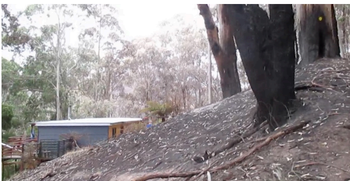
Main and bottom left image: The house is still standing even when all the surroundings were engulfed in a bushfire that destroyed other houses in the same area.