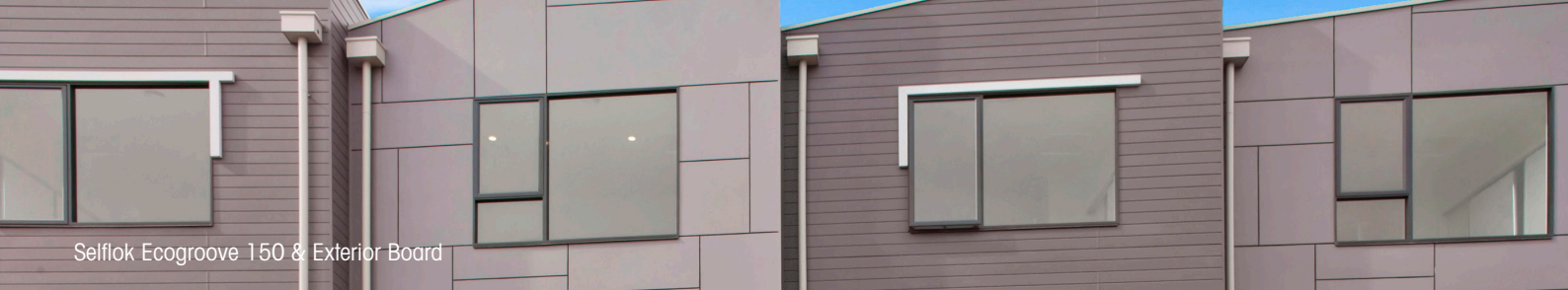
Selflok Ecogroove 150 & Exterior Board