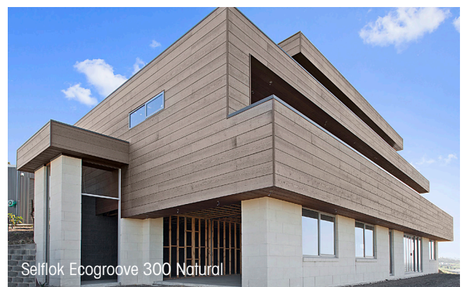
Selflok Ecogroove 300 Natural