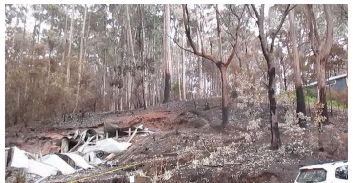
Bottom Right: Rubble is all that is left of a neighbours house, seen on the left of the image. Damo's house can be seen still standing off to the right edge of the photo.