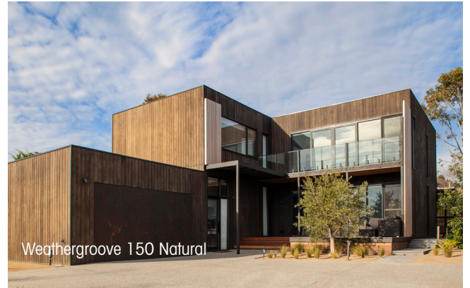
Weathergroove 150 Natural

Weathertex has similar properties to most fire resistant timber species; our products have been assessed by a third party for verification to the bushfire standard. The Australian Standard AS3959: Construction of Buildings in Bush fire Prone Areas provides the framework for what is now acceptable in building throughout most of Australia. Weathertex is suitable for use in BAL-LOW, BAL-12.5 and BAL-19 construction levels. The BAL rating determines the product's resistance to the direct radiant heat in the event of a bushfire. Check with your local authorities to establish what is acceptable in your location.