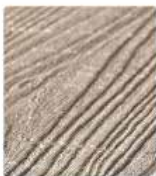
Antique Wash (089)