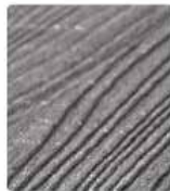
Cape Town Gray (011)