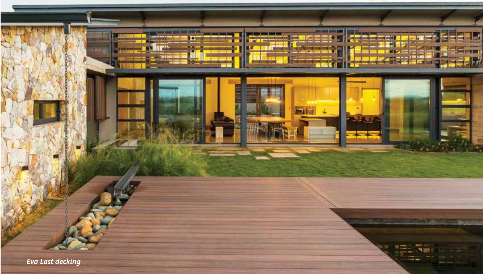
Eva Last decking