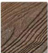
Tiger Cove (008)