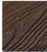
Espresso Roast (015)