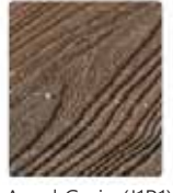
Aged Grain (J1R1)

Auckland , 64 Stoddard Road, Mt Roskill-1041. PO Box: 27-496, Mt Roskill-1440.