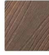
Smoked Bark (Q1R)